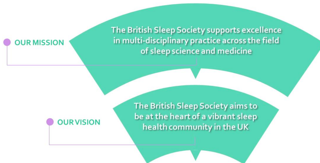
Figure 2 – Our Mission and Vision

Our Mission statement sets out who we are as an organisation and what we do. Our Vision statement explains what we seek to achieve together over the next five years. Together these statements define our purpose and outlook (Figure 2).